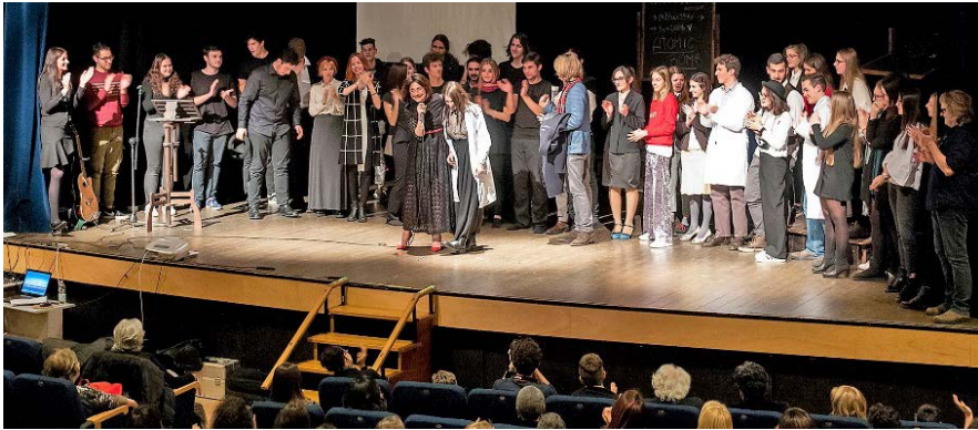
Figure 1. Theatre Teaches, Professor and students, University of Brescia (2018).