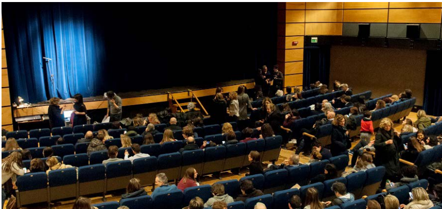
Figure 2. Theatre Teaches, the spectators, University of Brescia (2018).

Referring to the review carried out by Taylor and Ladkin (2009) it is possible to distinguish all four different methods of training using Theatre Teaches. In particular, Transfer of Skill and Manufacturing are the most developed ones.